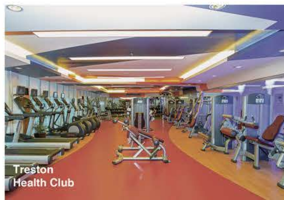
Treston Health Club